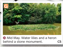
Mid May. Water lilies and a heron behind a stone monument. C5