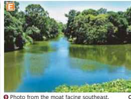
Photo from the moat facing southeast. C3