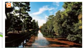
Mid December. View of the west moat from the left side of the Worship Gate. C4