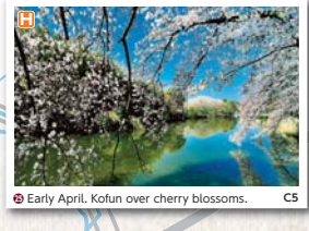
Early April. Kofun over cherry blossoms. C5