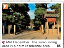
Mid December. The surrounding area is a calm residential area. B5