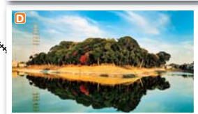
Mid December. Beautiful silhouettes on the water surface. D5