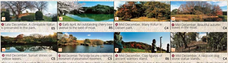
A: Late December. A climbable Kofun is preserved in the park. B5 B: Early April. An outstanding cherry tree is preserved in the park. B5 C: Mid December. Many Kofun in Daisen park. C4 D: Mid December. Beautiful autumn leaves in the moat. C4 E: Mid December. Sunset shines on a monument of preservator's movement. C5 F: Mid December. Clay figures of ancient warriors stand. C5 G: Mid December. A raccoon dog stone statue stands. C4 H: Late December. A climbable Kofun is preserved in the park. B5 I: Mid December. The bridge became a memorial monument of preservator's movement. C5 J: Mid December. Clay figures of ancient warriors stand. C5 K: Mid December. A raccoon dog stone statue stands. C4 L: Mid December. Beautiful autumn leaves in the moat. C4

Recommended Photo Spots Kofun walking gives visitors a beautiful view of the landscape in all four seasons. We recommend the excellent spots for taking photos.